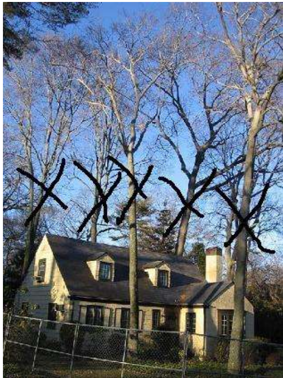
37 Laurel Lane Proposed tree removals 3/5/12